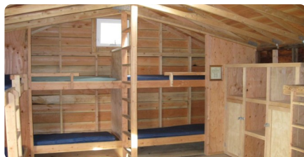
Typical Main Camp Cabin Interior

Main Camp cabins are off grid, rustic, and are located on the beach or nestled among the trees. Fully enclosed, these have bunk beds for 12 guests and cubbies to store your belongings. Participants provide their own linens. Bathroom facilities with showers are a short walk away. Most cabins do not have electricity. If you require electricity for medical reasons, please inquire about availability during registration. Cabins are shared with other families. You can request another family through your registration in UltraCamp.